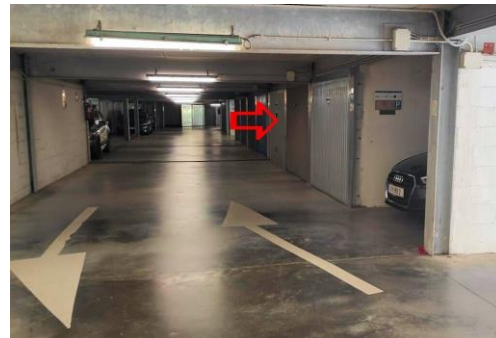
View from the first barrier (follow the arrow...)